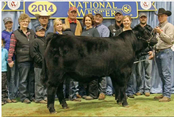
Alumni 7513A - Sire of lot 7

Calving ease bull by Alumni with good growth and weaning EPD's 76# start up to a 754lb WW. Top 20% WW, Top 25% YW. Homo Black and Homo polled.