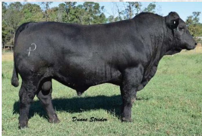
Carolina Big Harvest Sire of Lots 14, 16, 18, 34 and 35

63% Big Harvest Calf sitting in the Top 35% for WW, TM, and YG. Top 15% for CW and Top 20% for REA. Homo Black and Homo Polled.