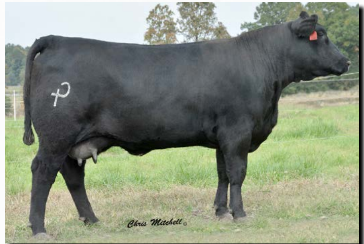
Carolina Pinnacle 3303A - Dam of lot 19

75% calf sired by Final Frontier. His Relex Dam is a full sister to the 2301 Performer cow who won the first heifer futurity in 2013. Homo Black.