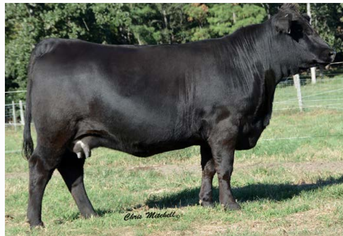
CCRO 3326A Donor Dam of Lots 33 and 34 Full sister to Carolina Exclusive and feature lot at the 2019 National Gelbvieh Sale

Two 75% flushmate sisters sired by Big Harvest and the 3326 Donor cow. You will certainly like this pair of heifers with great EPD's. Excellent brood cow prospects. Top 15% WW, YW and TM. Top 5% REA and Top 10% CW. 8704 AI'd to JRI Probity on 2-6-20.