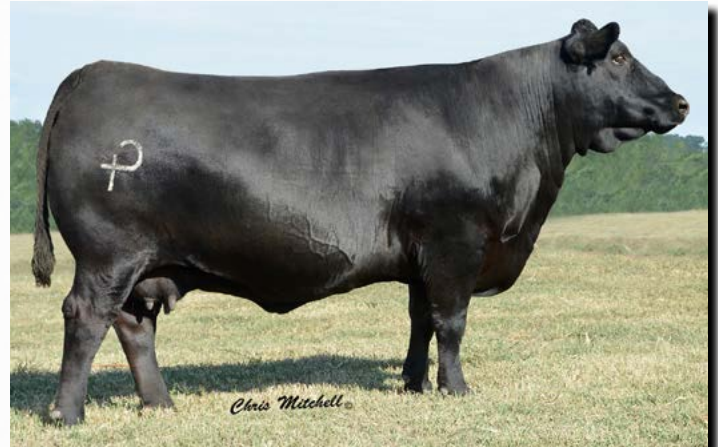
CCRO Another Man's Gold 0300X Maternal sister to Lot 38

Could have the most potential of any animal in the sale! Don't over look this Big Bounty 6015 heifer out of a 224Y dam. Excellent growth and carcass EPD's! Sells open.