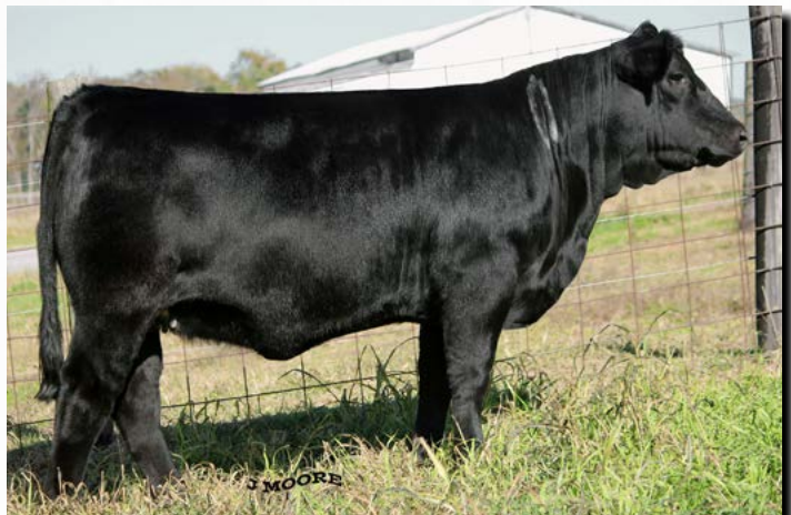
CCRO Carolina 4302B Maternal sister to Lots 35, 36 and 37 2016 NAILE Showcase Sale feature female

A set of 3 50% ET flushmates sired by Black Marble Tender and the 9759 Donor cow. Rare chance to purchase 3 heifers of this caliber. Excellent carcass and performance EPD's. 8703 AI'd to JRI Probiy on 2-3-20.