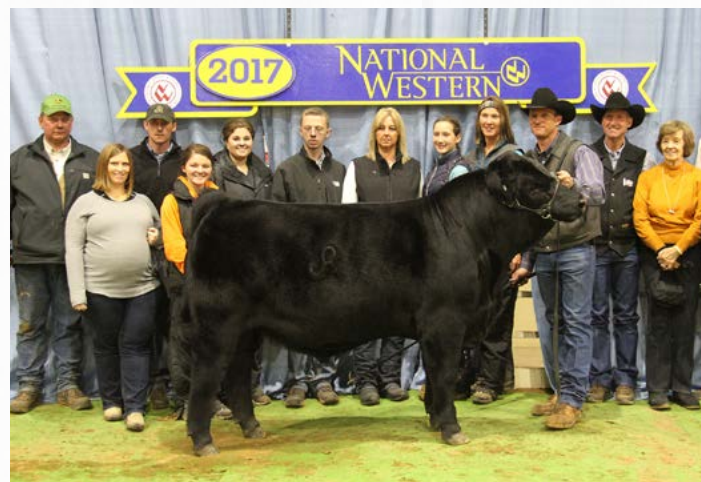
JRI Probity Service Sire of Lots 32, 33, 34, 35, 36, and 37 2018 Balancer Bull Futurity Champion

Two 75% flushmate sisters sired by Big Harvest and the 3326 Donor cow. You will certainly like this pair of heifers with great EPD's. Excellent brood cow prospects. Top 15% WW, YW and TM. Top 5% REA and Top 10% CW. 8708 AI'd to JRI Probity on 1-25-20.