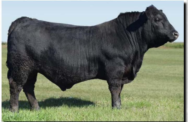
CCRO CCROSS President 9200G