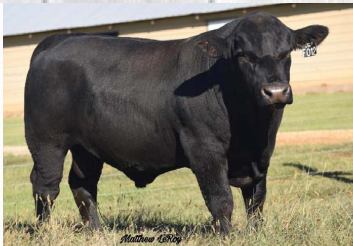
Southeastern F12 Service sire of Lot 23, 24, 25 and 26

Homo Black Homo Polled Black Crown daughter out of the 8343 cow who is still producing for us at age 12. Mate this 75% female to produce Balancers or Purebreds. Sells with a Heavy Duty sired calf at side DOB 10-15-19 66lb. AI'ed to New Horizon on 1-10-20. PE to Southeastern F012 1-31-20 thru 3-15-20.