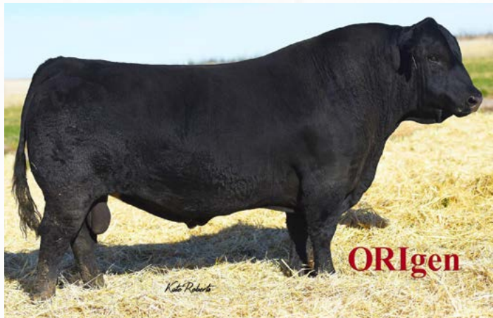
Black Marble Tender Sire of Lots 22, 35, 36 and 37

Here's one that fits any program! A 75% 3326 ET heifer sired by Black Marble Tender with a Leverage heifer calf at side. Great EPD profile and she is Homo Black and Homo Polled with a super disposition. Sells ready to AI or turn to the bull of your choice.