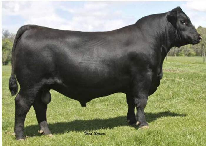
Heavy Duty - Sire of Lot 23A

You'll love this Homo Black 94% Exclusive sired female out of the JEMG Miss Libby female we bought out of the Iowa Beef Expo a few years back. Shes off and running with her 50% balancer heifer calf sired by our Angus herd sire Heavy Duty 5AD25. DOB 10-26-19. AI'd to SAV President on 1-10-20. PE to Southeastern F012 1-31-20 thru 3-15-20.