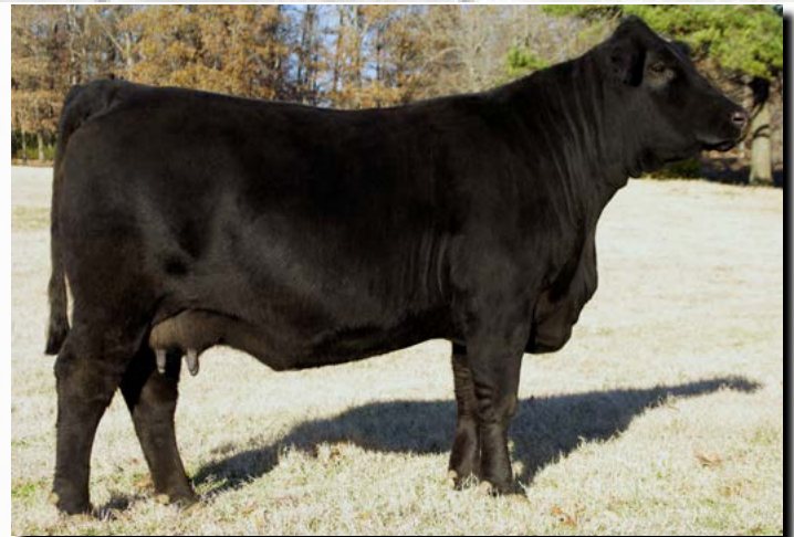
C CROSS Performer 2301Z Full sister to the dam of Lot 19

PB 88% by the 7551B Jackpot Bull. Use him to improve performance and add carcass and maternal traits. Top 5% YW, Top 1% MB, Top 15% WW, and Top 2% REA. Homo Black and Homo Polled.