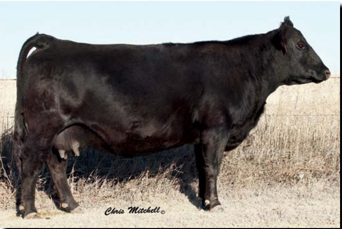
Ms Matron 802U - Donor Dam of Lot 2

If you like them deep and thick with EPD's to take your herd up a notch then you're gonna like this SAV President son out of the 300X lineage. This BA 43% is an outstanding individual! Top 25% YW, top 30% CED, WW, HP, $ cow, and top 15% REA. SAV President sired the all time high selling Angus Bull, America who sold for 1.51 million. Expect excellent bulls and females from this herd sire. His grandam is the 300X Donor Female that has so positively impacted our program. Homo Black and Very Lightly Scurred.