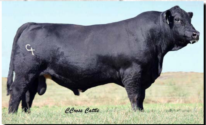
CCRO Carolina Elevator 6218D Maternal brother to Lots 35, 36 and 37 2019 Ky Beef Expo Reserve Grand Champion Balancer Bull

A set of 3 50% ET flushmates sired by Black Marble Tender and the 9759 Donor cow. Rare chance to purchase 3 heifers of this caliber. Excellent carcass and performance EPD's. 8709 AI'd to JRI Probiy on 2-4-20.