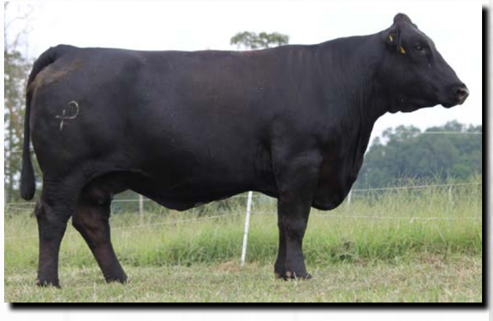
CCRO Carolina 2332Z - Dam of Lot 3