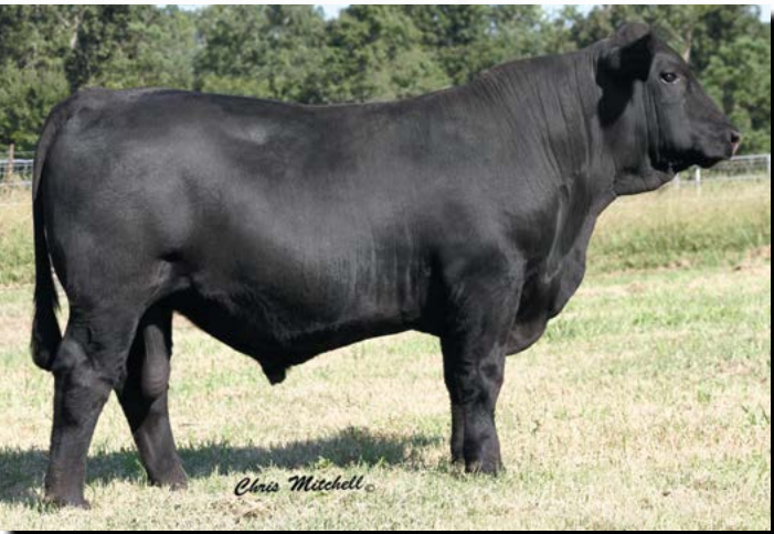
Carolina Exclusive - Sire of Lots 15 and 23