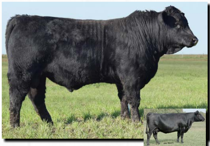
C CROSS Carolina 8208F

One of my favorite Big Bounty calves to date. You'll appreciate how he brings phenotype and maternal together. The 9760 Donor cow puts top selling bulls and females in the sale pens year after year. Super choice for breeding cows and retaining females. Flawless teat and udder on both sides of the pedigree. Homo Black and Homo Polled.