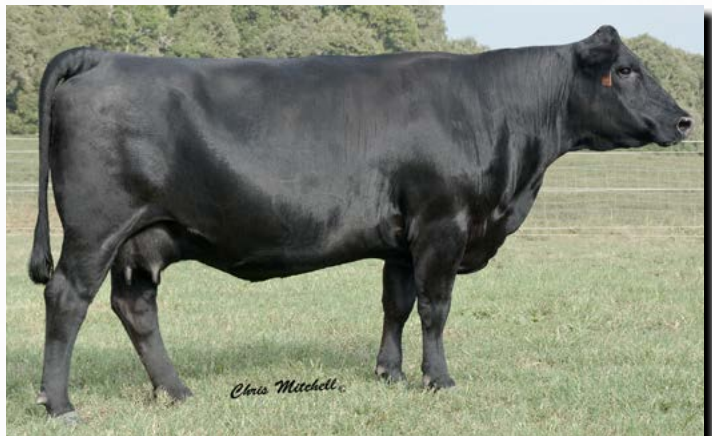
CCRO Ms Blackbird 9759W Donor Dam of Lots 35, 36 and 37

A set of 3 50% ET flushmates sired by Black Marble Tender and the 9759 Donor cow. Rare chance to purchase 3 heifers of this caliber. Excellent carcass and performance EPD's. 8710 AI'd to JRI Probiy on 2-6-20.