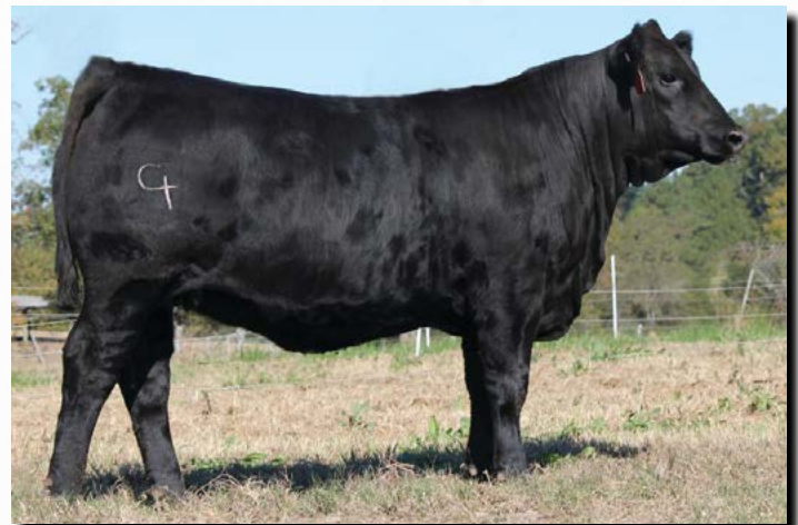
Carolina Hot Fudge 8700F - Full sister to Lot 1