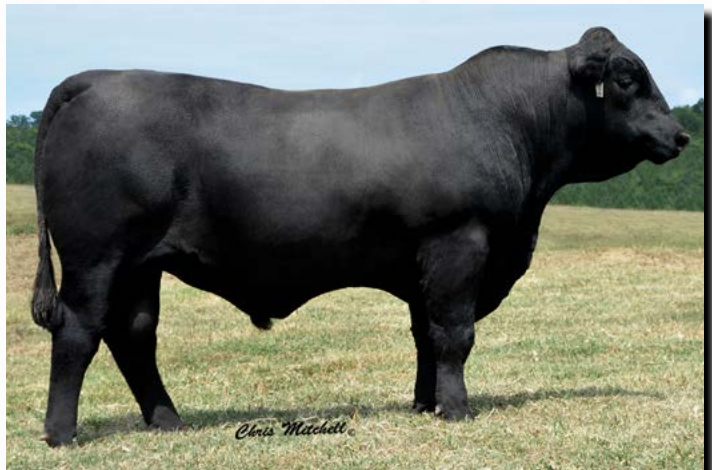
Carolina Big Bounty Sire of Lots 6, 10, 38 and 39

Looking for a Purebred 88%? Search no further. A Leverage AND Exclusive grandson that proves their worth. Top 10% YW. Top 5% REA. Top 4% HP. Top 2% PG 30. Excellent maternal bull to keep replacement females from. Homo Black and Homo Polled.