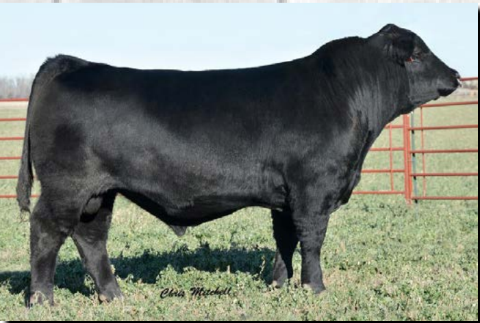
Jackpot 7551B - Sire of Lot 11