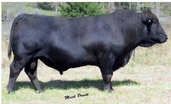
Intimidator 617Z - Sire of Lot 26A

Homo Polled Colton sired female out of a Premonition daughter. Sells with an Intimidator bull calf at side DOB 9-4-19 74lb. Sells PE to Big Bounty 6015 9-25-19 thru 11-10-19. PE to Southeastern F012 1-31-20 thru 3-15-20.