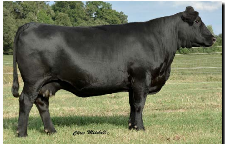
CCRO Fortune In Focus 8361U - Dam of Lot 38

Homo black heifer sired by Big Bounty 6015. Natural calf out of the 8361 Donor female still producing here at C-Cross. Check out the breed leading EPD's! Sells open.