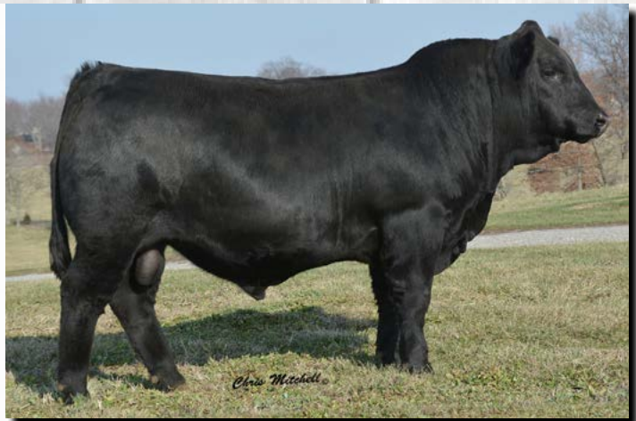
Carolina Leverage Sire of Lots 2, 4, 7, 8, 12 and 40

You're gonna like the depth and thickness of this 75% Leverage son out of an Exclusive 1230Y Dam. He sports a nice EPD Package and has a super disposition. Lots of rib and hip in this bull sure to produce excellent feeder calves and replacements. Top 10% WW and Top 15% YW. Top 2% REA. Super Index and Carcass EPD's. Homo Black and Homo Polled.