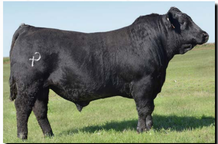
C CROSS Hot Fudge 8800F ET

The 607 Donor Cow continues to produce some of the best seedstock we sell every year and the Hot Fudge mating doesn't disappoint. Tremendous bone, nice hip, spring of rib and eye appeal, as well as a puppy dog disposition puts this bull in the Lot 1 slot. Top 30% WW and Top 40% YW in this timelessly, proven mating. A full sister, CCRO 8700F ET was runner up in the 2019 Heifer Futurity. Excellent Maternal Herd Sire. Homo Black and Homo Polled.