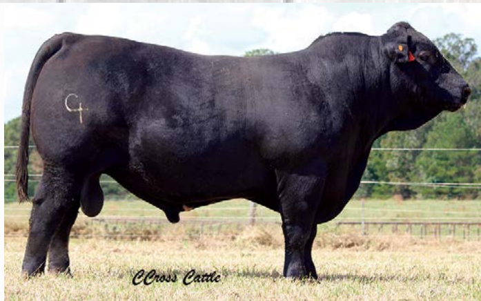
Clinch Mt Legacy 1701E Sire of Lots 27A and 28A

50% Balancer Homo Black Colton sired female out of a Future Investment dam. Off to the races with her 2nd calf. Sells with a Legacy 1701E heifer calf 72lb DOB 2-18-20. Homo Black.