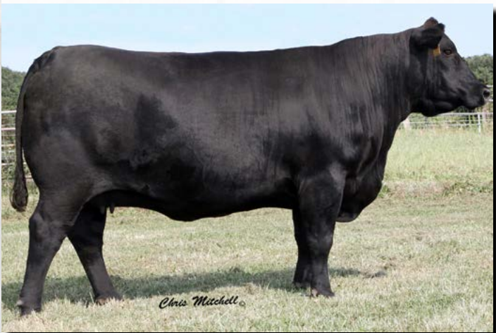
Ms Twila's Focus W607 ET - Dam of Lot 1