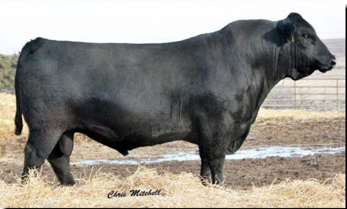
Post Rock Highly Focused - Sire of Lot 13