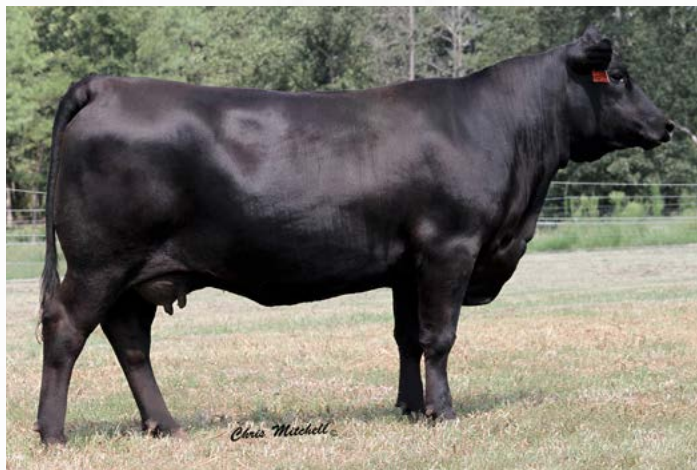
CCRO Emblazin Mistress 9155W - Dam of Lot 10

Homo Black 63% Balancer sired by Big Bounty out of the 9155 Donor Dam. Use this maternal package to add milk and maternal to your herd- Top 10% milk, Top 10% TM, Top 35% CW and REA.