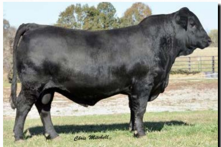
Final Frontier - Sire of Lot 19 Resident herd sire for C-Cross Cattle

Youngest bull in the offering but he's a good one! Pedigree is stacked with Bushwacker 41-93, Impact and Silver. Use this 75% bull to improve carcass and performance. Top 25% WW, Top 35% YW, and Top 3% REA. Homo Black and Homo Polled.