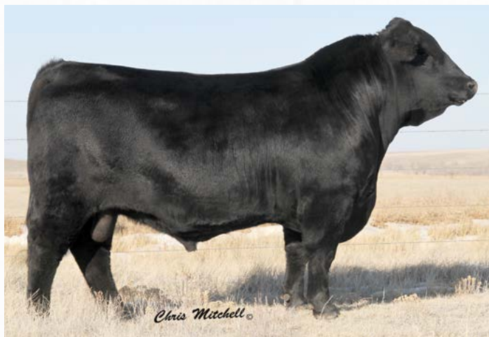
Bar GT Colton 292X - Sire of Lots 25, 26 and 27

Colton sired female doing a great job with her first calf by Intimidator 617Z. DOB 9-3-19 - 68lb. Sells PE to Big Bounty 6015 9-25-19 thru 11-10-19. PE to Southeastern F012 1-31-20 thru 3-15-19.