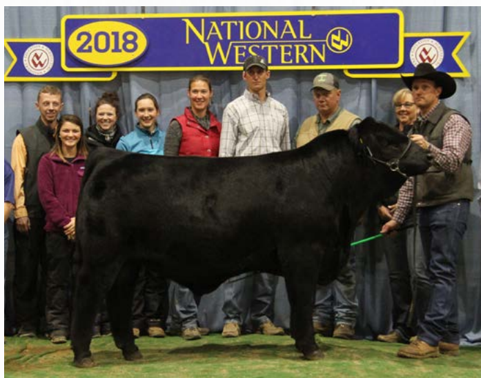
JRI Transformer - Service Sire of Lots 30 and 31

Homo Black 75% Rancher 102C daughter out of a Reflex dam. Nice package. Sells AI'd to JRI Transformer on 12-7-19. Safe to the AI with a fetal sexed bull calf.