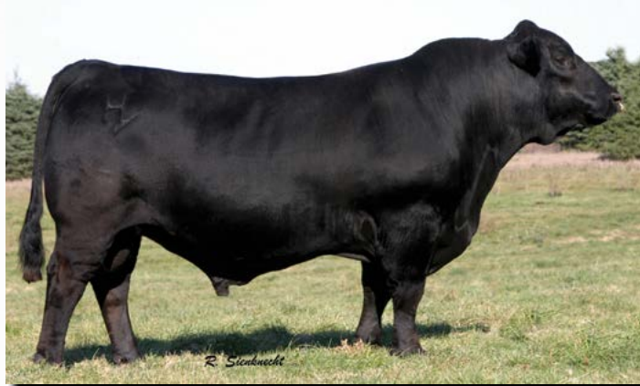
Black Impact - Sire of Lot 21

Homo Black and Homo Polled Black Impact daughter. Excellent disposition. Maternal Grandam is the W-607 donor female. Sells with a Final Frontier heifer calf DOB 10-15-19 -75lb AI'd to New Horizon on 12-2-19 - Safe to the AI.