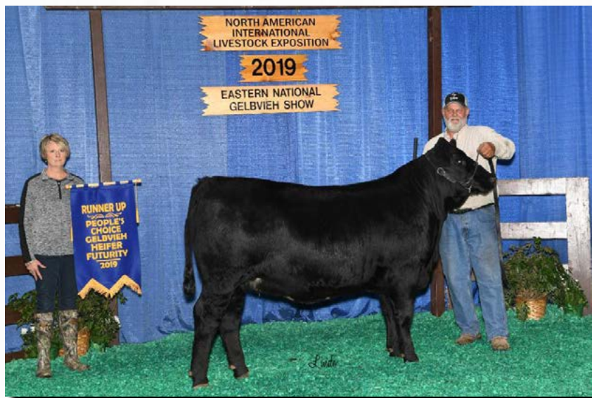
Carolina Hot Fudge 8700F - 2019 Heifer Futurity Runner Up