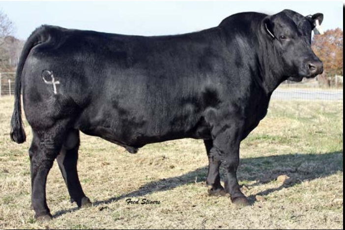
Carolina Tuxedo - Full brother to Lot 2