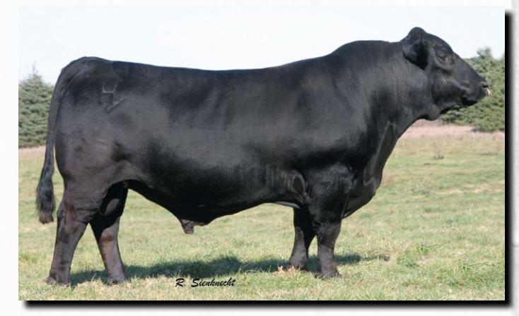
Black Impact - Sire of Lots 17 and 18

Black Impact continues to crank out the good ones. This 99.9% Purebred Bull sits in the Top 4% HP. Top 10% WW. Top 15% Docility. Top 20% YW. Top 35% HP. 40cm Scrotal, Hetero Black