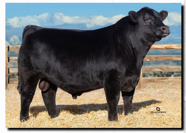
FrontRunner - Sire of Lots 5, 6, 7 and 8

cow families stack the odds for great progeny to come. Top 2% YW. Top 4% PG30. Top 5% REA. Top 10% CW and WW. Top 15% TM. Top 20% HP. Top 35% MILK and YG. Top 45% DOC and SC.