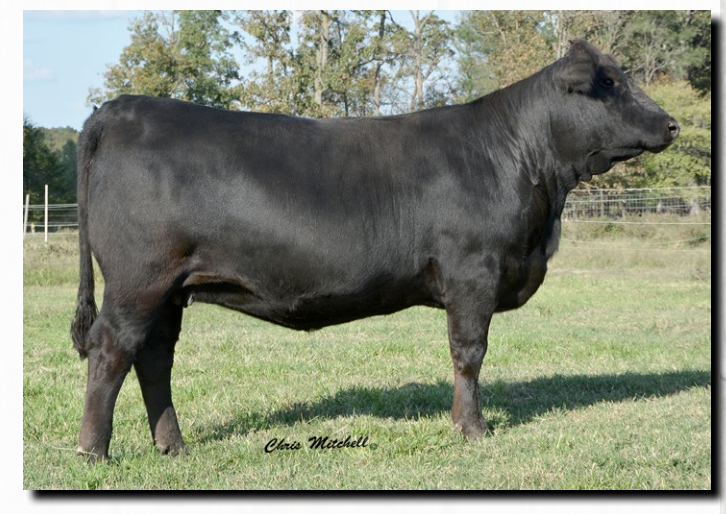
Carolina 5171C - Donor Dam of Lots 1 and 2

Once in a while one of those special cows comes along. If you get them identified quickly in your program the results can be tremendous. The CCRO 5171 Donor has been one of those cows, producing well no matter how we've mated her. 5171's first calf was the dam of the 2022 Breeder's Choice Gelbvieh Futurity Champion bull, Manifesto J104. These 2 Davidson Jackpot 74Z sons are wide-based, thick, deep, and docile. Both are Homo Black and Homo Polled by Birthright. Top 1% PG30. Top 15% WW and YW. Top 25% TM.