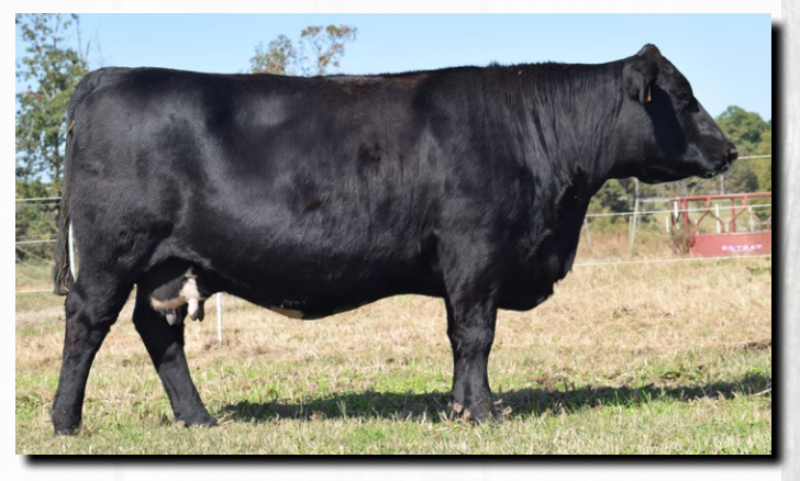
Ms Master 1021X - Dam of Lot 15

Top 1% HP, YG, and MB. Top 2% Milk and TM. Top 25% WW, YW, MB and SC. Top 30% DOC and CEM.