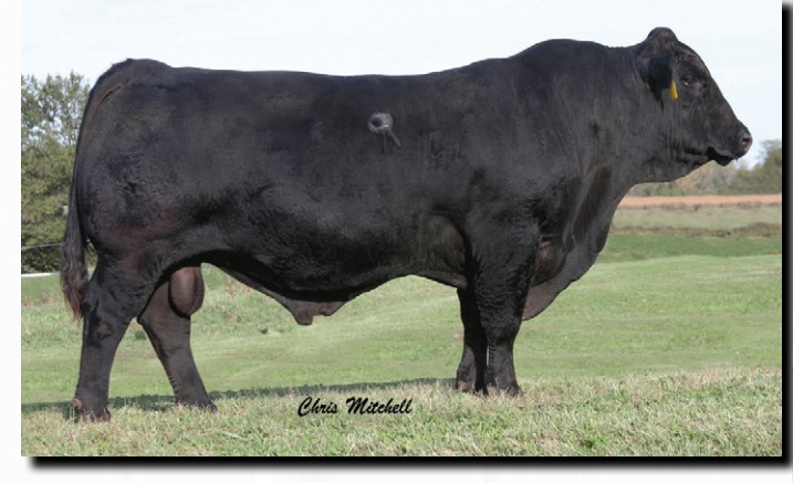
Post Rock Granite 200P2 - Sire of Lot 24

200P2 Son out of a 9347 x Colton Daughter. Excellent Maternal Package! Top 4% HP. Top 5% PG30. Top 25% Milk. Top 30% STAY, Docility and REA.