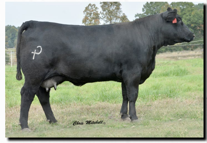
Carolina Pinnacle 3303A - Dam of Lot 8

Another Nice 87.5% Purebred Frontrunner by the CCRO 3303ET Female. Lightly Scurred. Top 10% YW. Top 15% WW. Top 35% MILK, HP and PG30. Top 45% Docility.