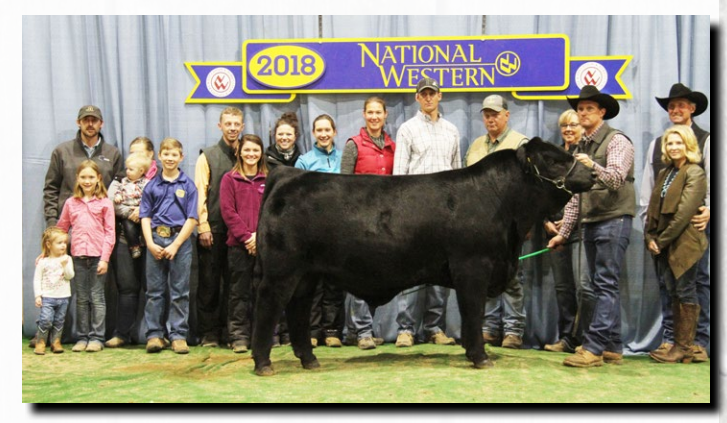
JRI Transformer 254E44 Sire of Lots 12, 13 and 14

Transformer Sired calf out of a No Miss cow family – Expect Excellent Teat and Udder on replacements as well as performance from this sire. Top 30% WW. Top 35% YW and HP