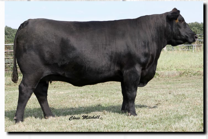
Twila's Focus W607 - Donor Dam of Lots 3 and 4

The 607 Cow has produced phenomenally for us. These 2 ET brothers are products of her first flush, way back in 2011 where she made 28 eggs. Full sibs have been Sale Toppers and Heifer Futurity winners. Many Herd Sires and Donors have been produced from the exceptional Female. These 2 Reflex ET Brothers are the Cattleman's kind and will be some of the Last Genetics to be offered from this mating. Expect power, Performance, Docility, and Excellent Replacement Females from these 2 Bulls. Both Bulls are Homo Black by Birthright.