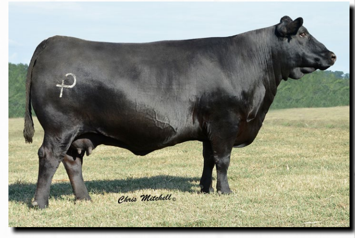
Another Man's Gold 0300X - Dam of Lot 29

2223- 89.8% Purebred sired by 74Z. Homo Black- Scurred. Top 10% WW and CW. Top 15% YW. Top 25% REA.