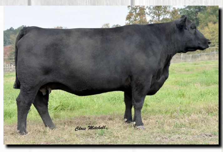
Justamere 10277 Tiffany 203 - Dam of Lot 23

Two ET Bulls sired by PVF Insight 0129 out of the 203Y Tiffany Donor Cow. Both are the smooth shouldered, easy calving kind. Perfect choice for heifers. Homo Black and Homo Polled. Top 15% DMI. Top 25% REA. Top 35% Docility.