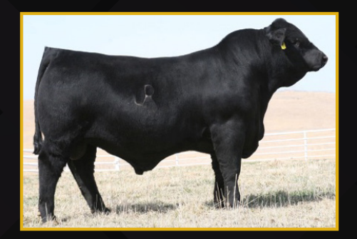
JRI TRANSFORMER 254E44