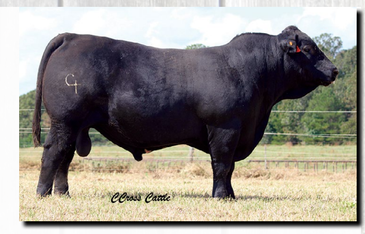
Clinch Mt Legacy 1701E - Sire of Lot 31