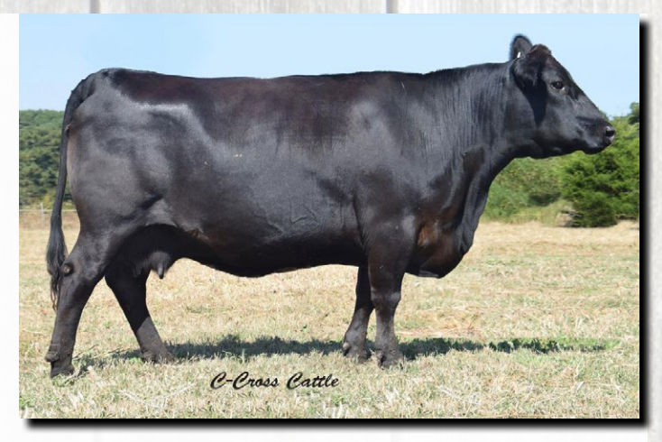
Ms Bombshell 9347W - Dam of Lot 20

Final Frontier and ET son that looks the part! No surprise either since he's from the 9347 Donor Female, Grandam of Leverage. He's full of RED MEAT and will add pounds to your calf crop. Top 3% YG. Top 5% PG30. Top 10% HP and REA. Top 15% Milk. Top 45% WW. 40cm Scrotal.