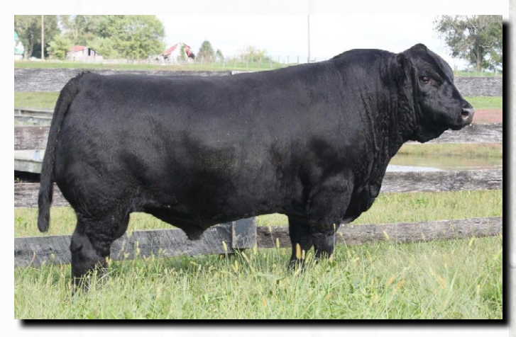
Godfather 575C - Sire of Lot 11

Looking for a stout heifer bull to cover your herd? This Godfather Balancer Bull checks the boxes! Top 15% CED. Top 45% BW. Excellent Intake and Carcass numbers. Hetero Black.