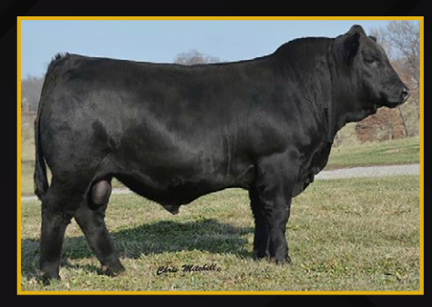
CCRO CAROLINA LEVERAGE 3214A