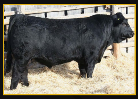
DVE DAVIDSON JACKPOT 74Z