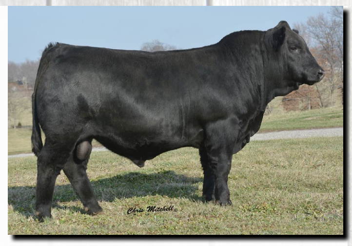
Carolina Leverage - Sire of lots 15 and 16

Another Top End 93.3% Leverage son with Stellar EPD's. Nice Square Hipped specimen that is the Epitome of what made Leverage progeny so appealing. Top 1% HP. Top 2% PG30. Top 25% Docility. Top 30% WW. Top 35% CED and YW.