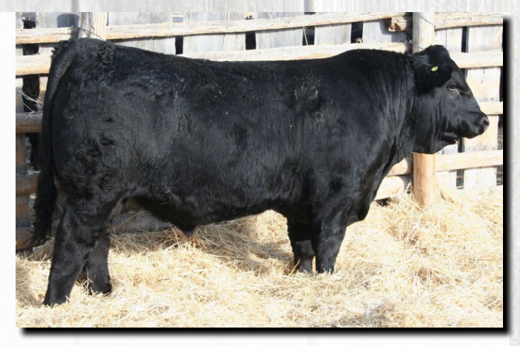
Davidson Jackpot 74Z - Sire of Lots 27 and 28

You'll like this 75% ET Balancer Bull out of the 9347 Donor Cow and sired by Davidson Jackpot 74Z. You should keep heifers back from this moderate maternal package. Homo Black and Homo Polled by birthright. Top 1% PG30. Top 10% YG and REA. Top 15% MILK and STAY. Top 20% TM. Top 35% HP.