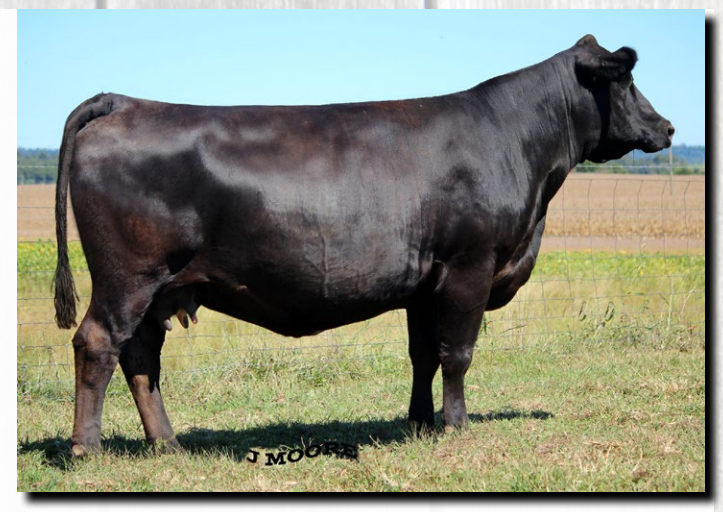
Ms Hero 175Y - Dam of Lot 13

Powerful Transformer son. Use him to add Frame to your calves. Top 15% WW, Docility and TM. Top 20% YW. Top 25% Milk.