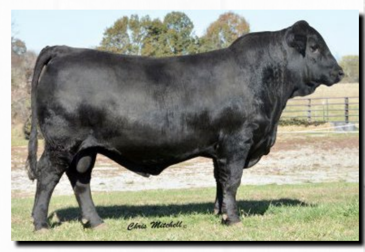
Final Frontier - Sire of Lots 19, 20 and 21

Another Final Frontier Son to choose from-Excellent Phenotype and Bone Top 15% PG30 and MB. Top 30% YW. Top 40% WW.