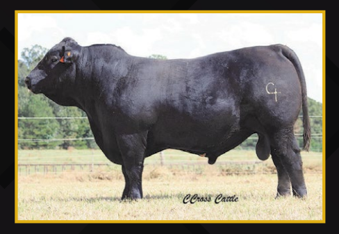
CMGF CCRO CLINCH MT LEGACY 1701E