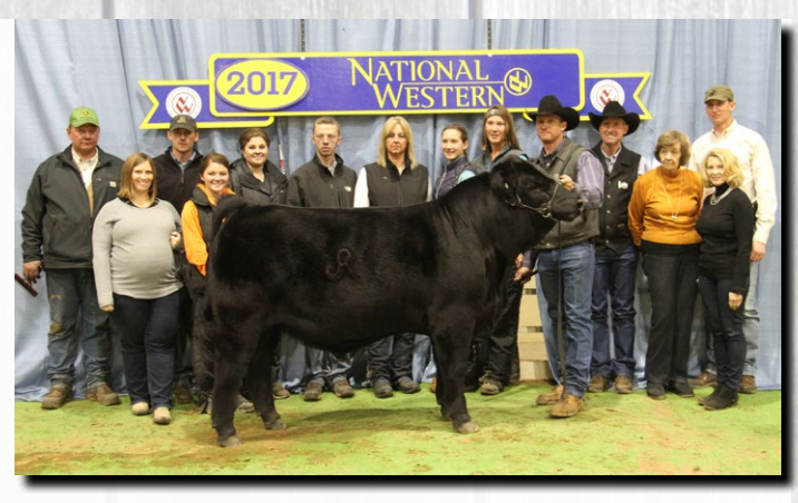
JRI Probity 254D28 - Sire of Lot 10

This Probity Son mated to a Silver daughter produced an eye appealing Specimen. Use him to produce pounds, profit and a great set of Replacement heifers. Top 3% CW. Top 5% Docility. Top 10% WW and YW. Top 40% REA.